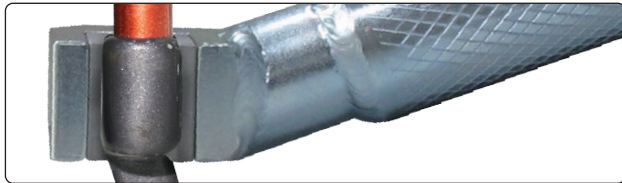
▲ Short end (20mm)

A tighter fit is more conducive to producing a bend that starts at the root of the hosel instead of above it.