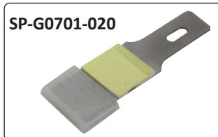
Spare blades 3 ea.