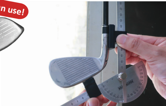
▲ Measuring Lie Angle