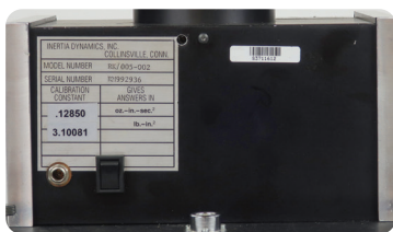
▲ Recalibration & data collection software emulator upgrade