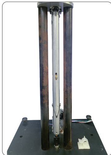
▲ Torsion spring and bearings replacement

For a free evaluation, email us detailed photos of your instrument along with a description of the issues to Sales@golfmechanix.com .